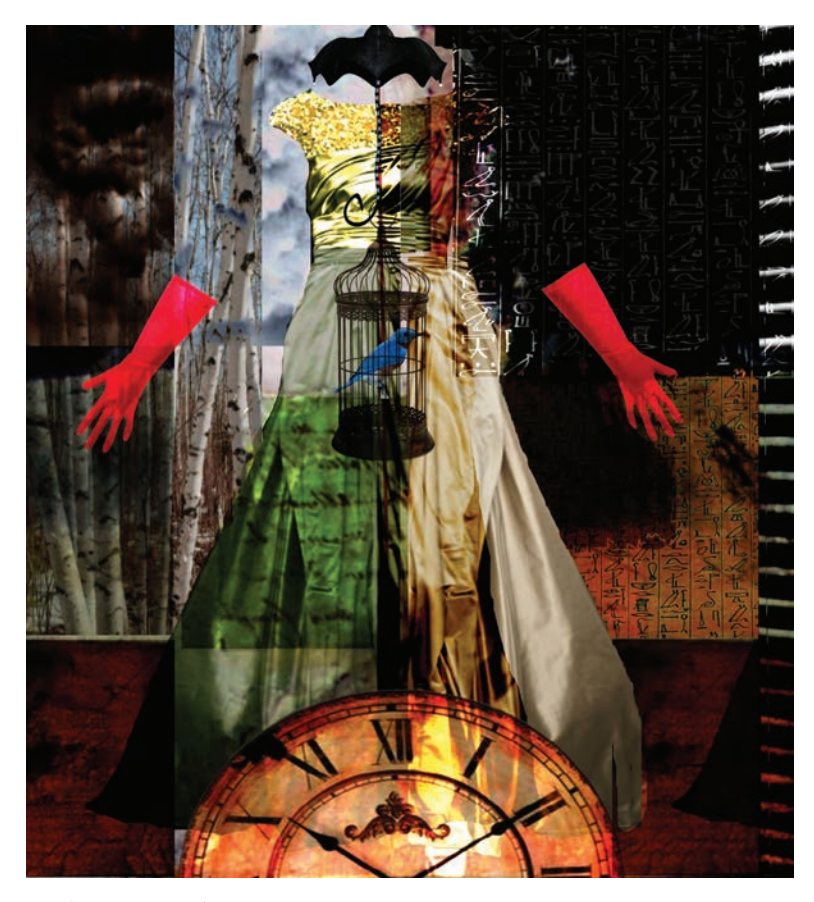
Birds Are Not The Target