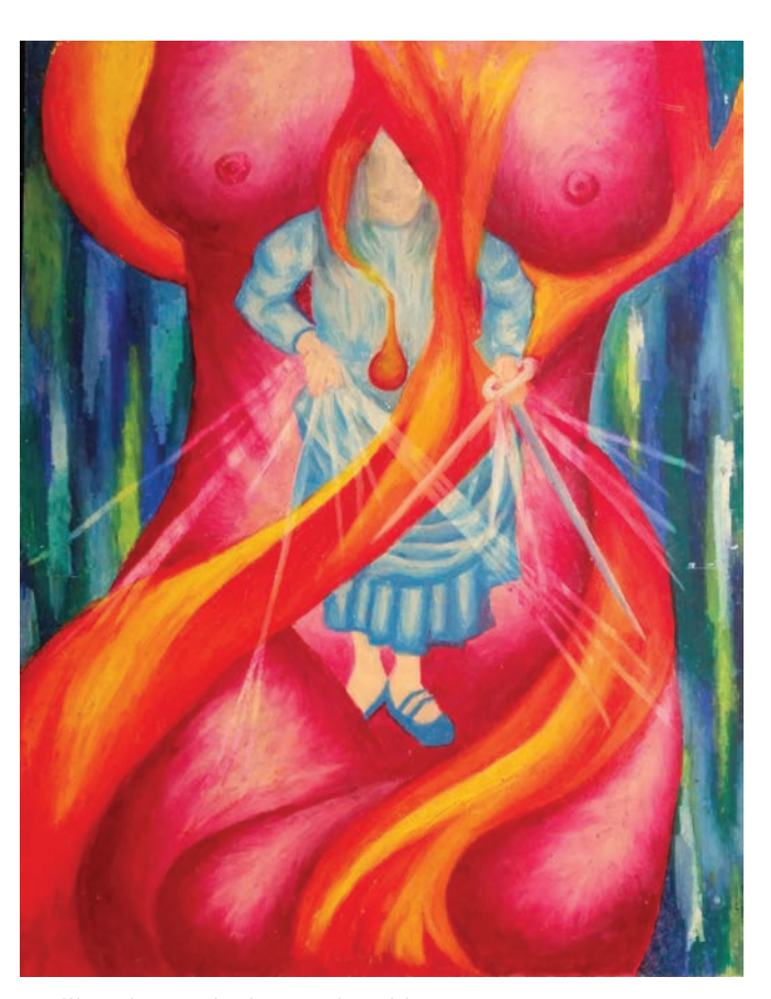
You'll Understand When You're Older